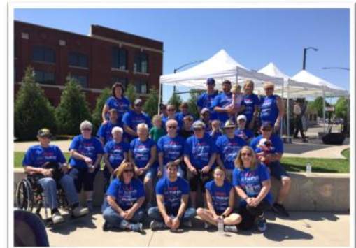
Team Aubree walkers