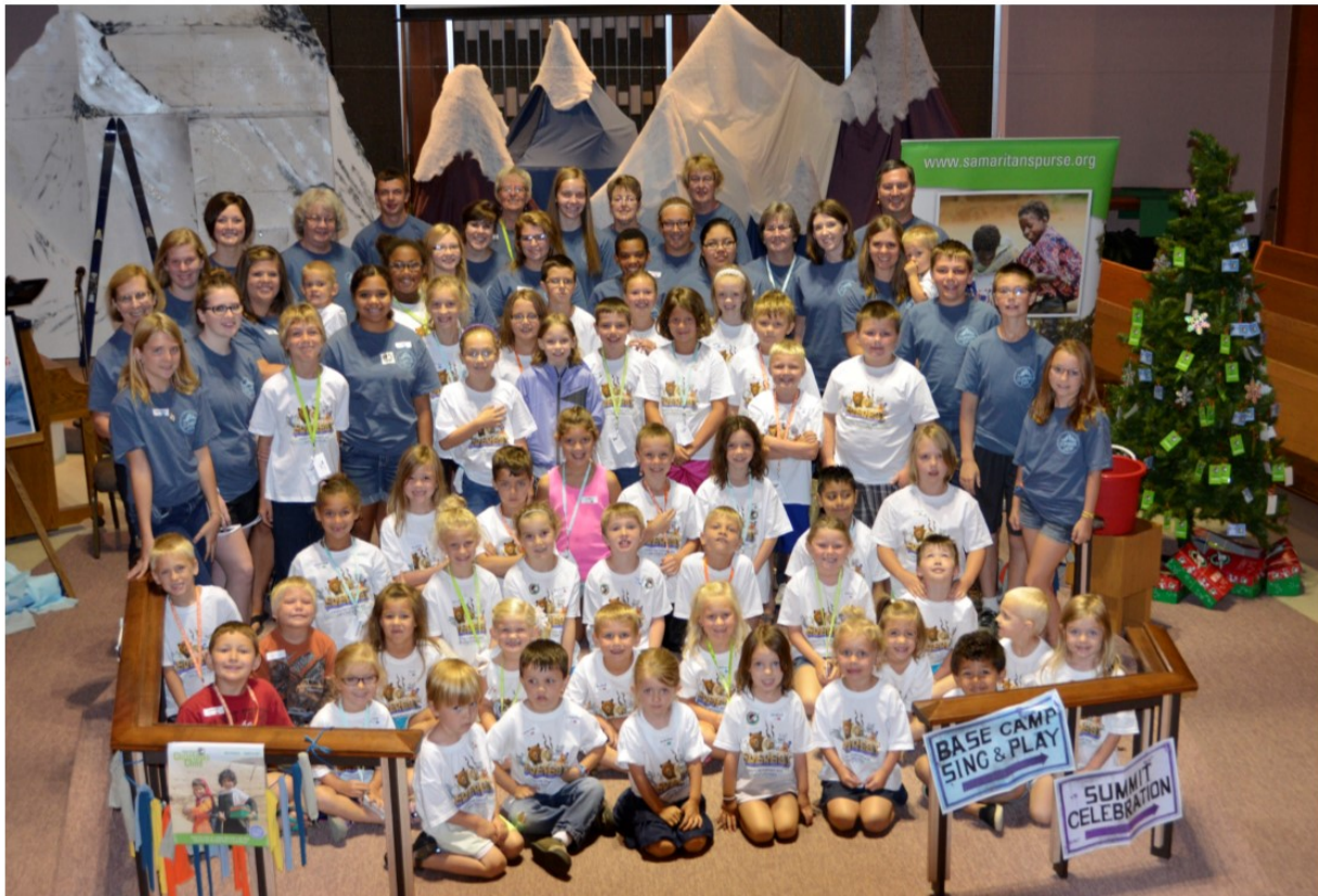
This photo of students and staff will be included with the shoe boxes we fill at our OCC packing party in November, so the children who receive those boxes know how God uses others to provide and comfort them.

Thank you to the congregation for opening the doors of our church to the children of the community during VBS. Thanks also to all the station leaders who prepared the lessons and activities, to the crew leaders who built relationships with the kids in their group, and to all the helpers who were willing to do whatever was asked of them.