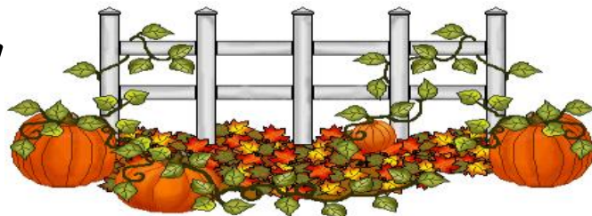
Shermans Pumpkin Patch

Office Hours Monday & Wednesday 8:00a-5:00p Tuesday & Thursday 8:00a-3:00p Friday Church is Closed